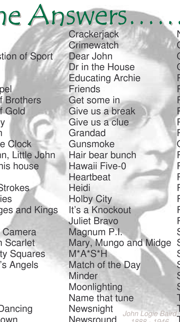
John Logie Baird 1888 - 1946